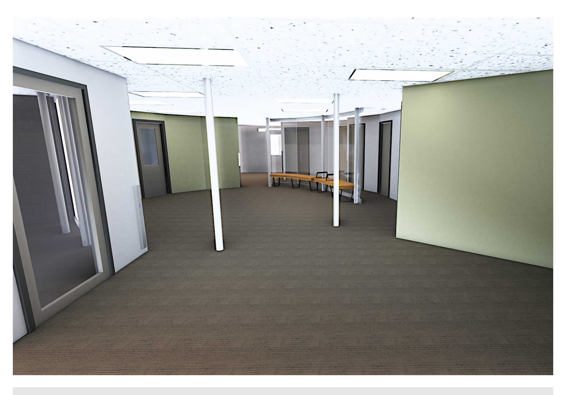
PROPOSED BASEMENT SEATING AREA & TUTORIAL ROOM

The largest program room at the St. Vital library is located in the basement, accessible by the elevator or by stairs. The 2016 library refresh will provide the sixty-person multi-purpose room with fresh paint, carpet and new glass doors. A new tutorial room with capacity for ten people will be added in the basement to increase opportunities for the public to reserve space for meeting and study at the St. Vital library. Glass wall panels and doors will be used to increase the feeling of transparency and openness in the basement. A new seating area with a bench will be created in the adjacent space to the program rooms. The basement will have a total of five washrooms, including a second UTR.