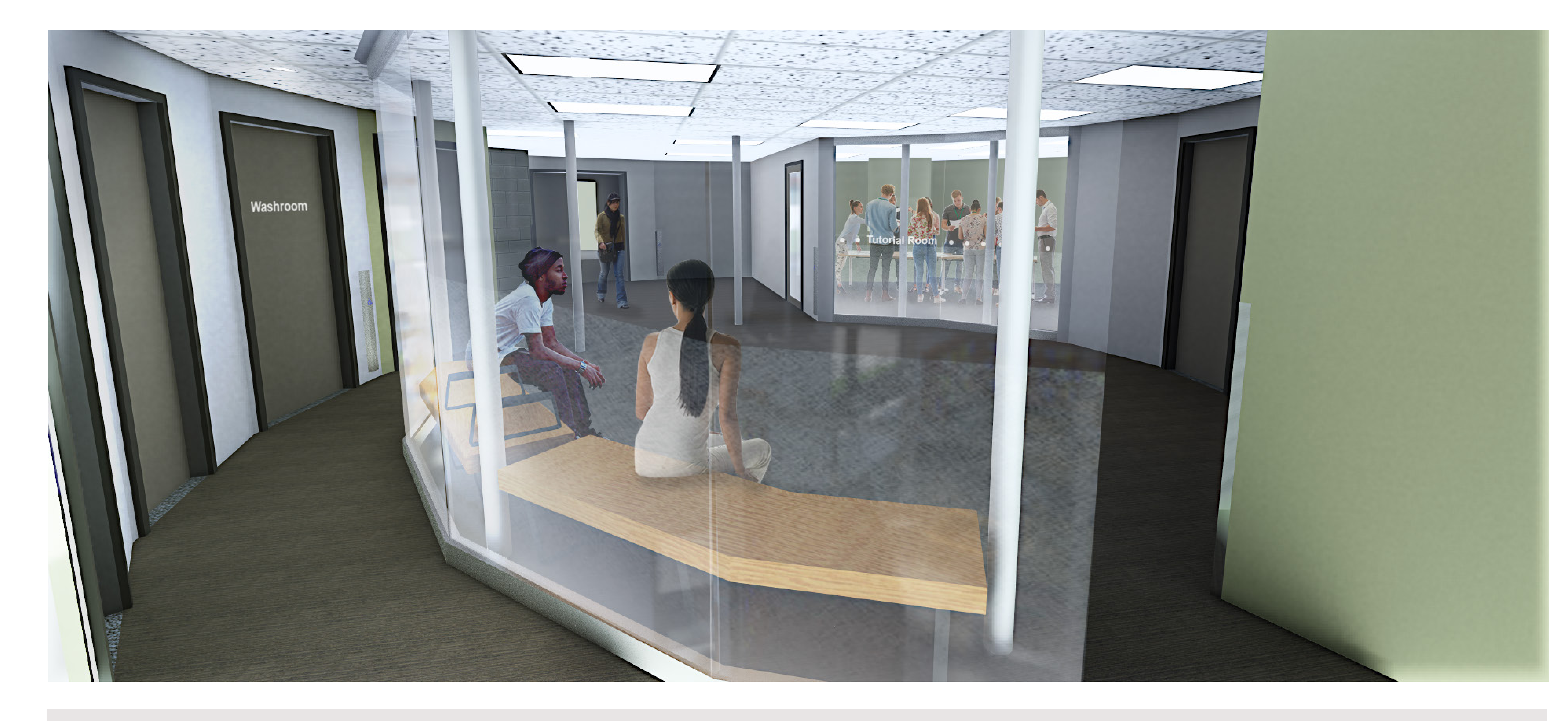
PROPOSED BASEMENT PUBLIC SEATING

The largest program room at the St. Vital library is located in the basement, accessible by the elevator or by stairs. The 2016 library refresh will provide the sixty-person multi-purpose room with fresh paint, carpet and new glass doors. A new tutorial room with capacity for ten people will be added in the basement to increase opportunities for the public to reserve space for meeting and study at the St. Vital library. Glass wall panels and doors will be used to increase the feeling of transparency and openness in the basement. A new seating area with a bench will be created in the adjacent space to the program rooms. The basement will have a total of five washrooms, including a second UTR.