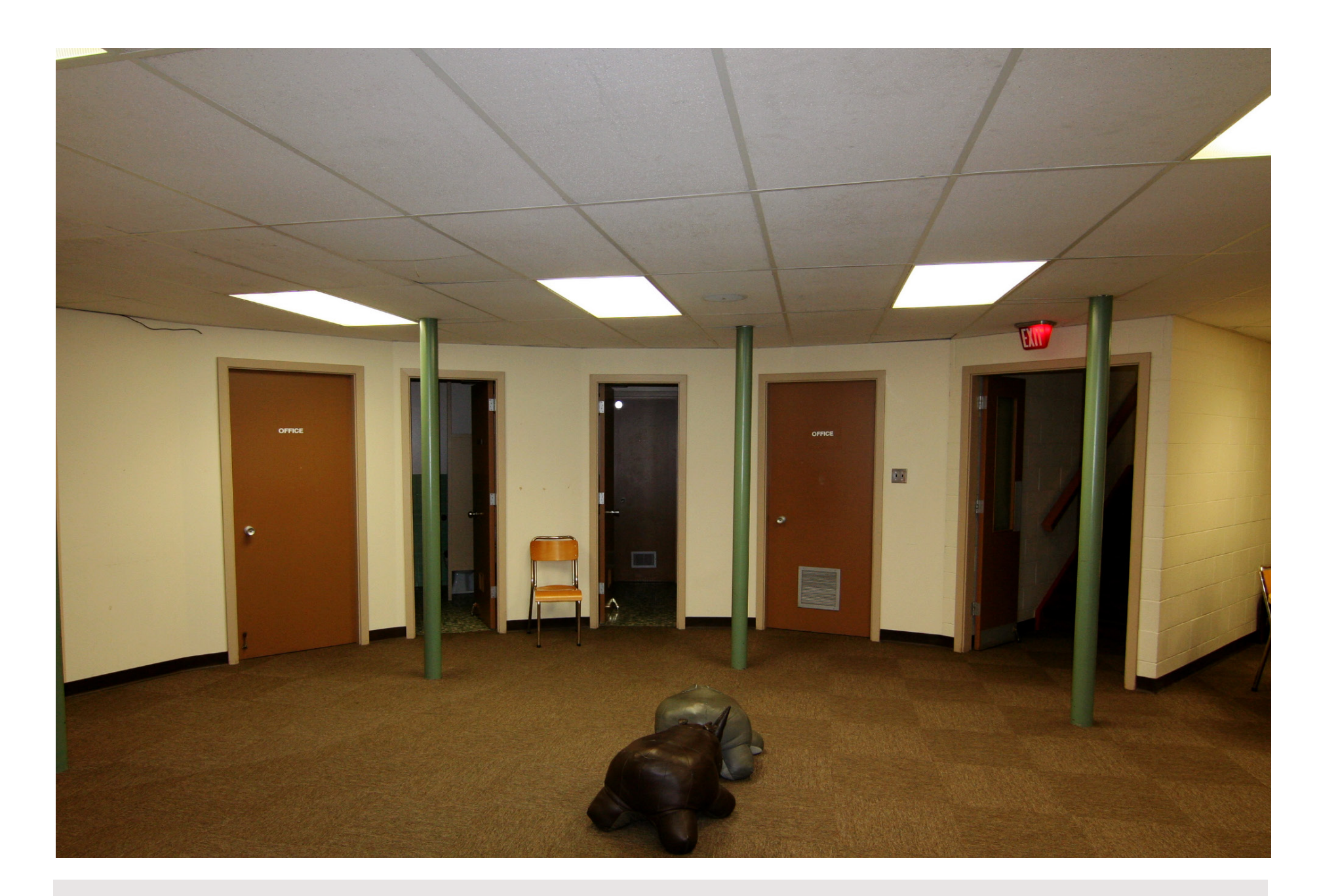
EXISTING BASEMENT (LOOKING TOWARDS WASHROOMS)