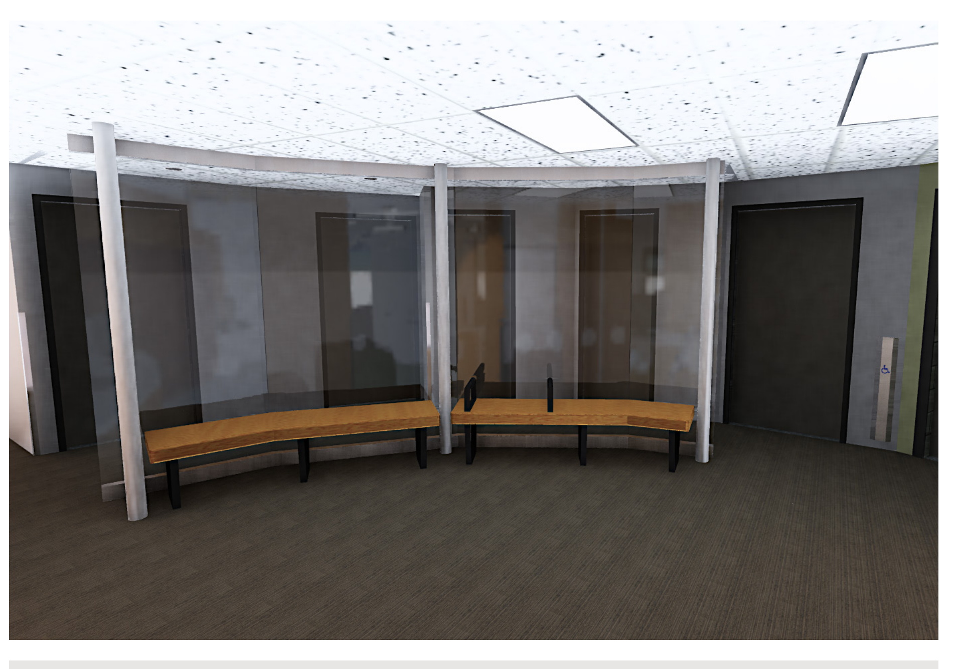
PROPOSED BASEMENT PUBLIC SEATING